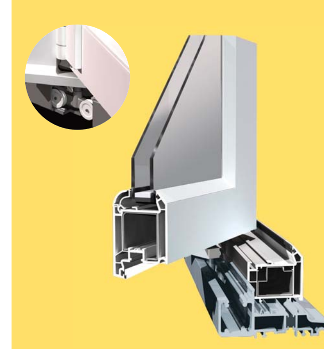
By selling bi-fold doors you are selling the fastest growing product in home improvements – a product that your customer will want to buy.